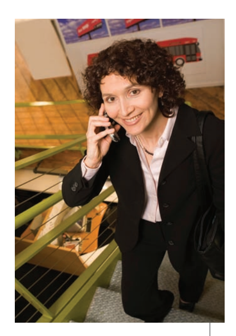
Wireless in-building mobility and remote location operation untethers workers from the confines of their desks.